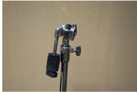
Remove the top assembly tilter unit from the C-790.