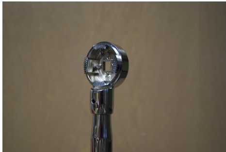
Top C-790 after removing the top assembly tilter unit.