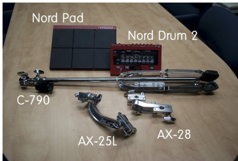
Parts List: Nord Drum 2, Nord Pad, C-790, AX-25L, AX-28

This is a flexible and uncluttered setup using only 3 pieces of Pearl Drum Hardware. This will let you mount both the Nord Drum 2 and the Nord Pad on the same stand and adjust height and tilt of both units.